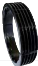
ACJ9059 PAIR OF PULLEY ADAPTER FOR JOLLY BIG ONE & TWO Ø 240 => Ø 280 mm