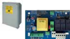
ABJ8042 R-CRX 2.0 control board for 1 JOLLY BIG. With radio receiver 433 MHz. With box IP55. See page 141 and 147