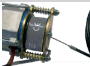
ACJ9019 ELECTROBRAKE for JOLLY ONE and JOLLY BIG assembly with 6 m cable, sheath and release knob