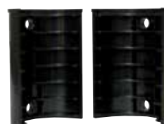
ACJ9058 PAIR OF HALF-SHELLS for JOLLY BIG ONE & TWO on shaft Ø 76 => Ø 102 mm