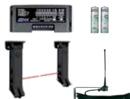
AD00316 SET NO TOUCH 868 MHz NO TOUCH+MASTER NO TOUCH+2 LITHIUM BATTERIES 3,6V+ANTENNA. Wireless Photocells to prevent impacts. See page 122