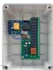
ABJ0015 R10-CRX control board for 10 JOLLY BIG with radio receiver 433 MHz. With box IP66.