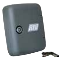
ACJ9086 STRONG-BOX VECOR FLAT - wall mounted (special lock) IP 54 - with electrobrake release and space for 2 modules in embedded box type 502E 128x150x42