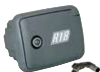
ACJ9078 STRONG-BOX STONE to embed (special lock) IP 54 with 1 rocker switch and electrobrake release 142x106x80