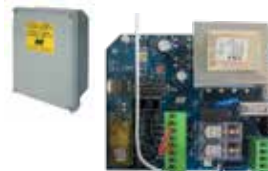
ABJ7080 J-CRX control board for 1 JOLLY BIG. With thrust regulator and radio receiver 433 MHz. With box IP55. See page 141 and 147