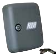
ACJ9071 STRONG-BOX FLAT wall mounted (special lock) IP 54 with 1 rocker switch and electrobrake release 128x150x42