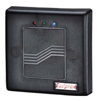
DG-360<sup>+</sup> Access Control Proximity Reader 3 3/8" x 3 3/8" x 13/16" (86 x 86 x 20 mm) Black finish European standard size