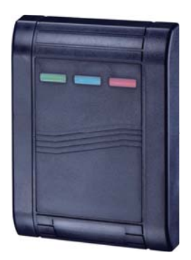
Easiprox<sup>+</sup> Access Control Proximity Reader 4 1/2" × 3 1/8" × 11/16" (114 × 80 × 18 mm) Navy blue finish