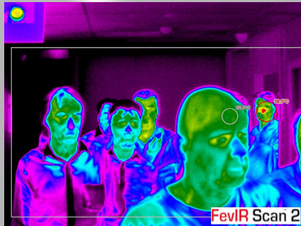
Multi Target Auto Tracking System