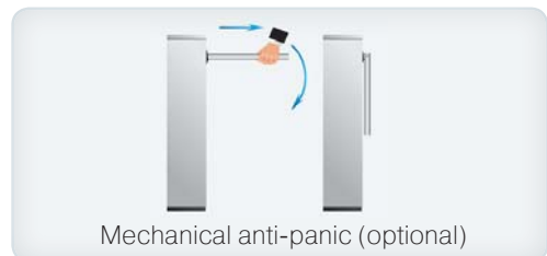
Mechanical anti-panic (optional)