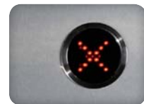
LED directional indicators