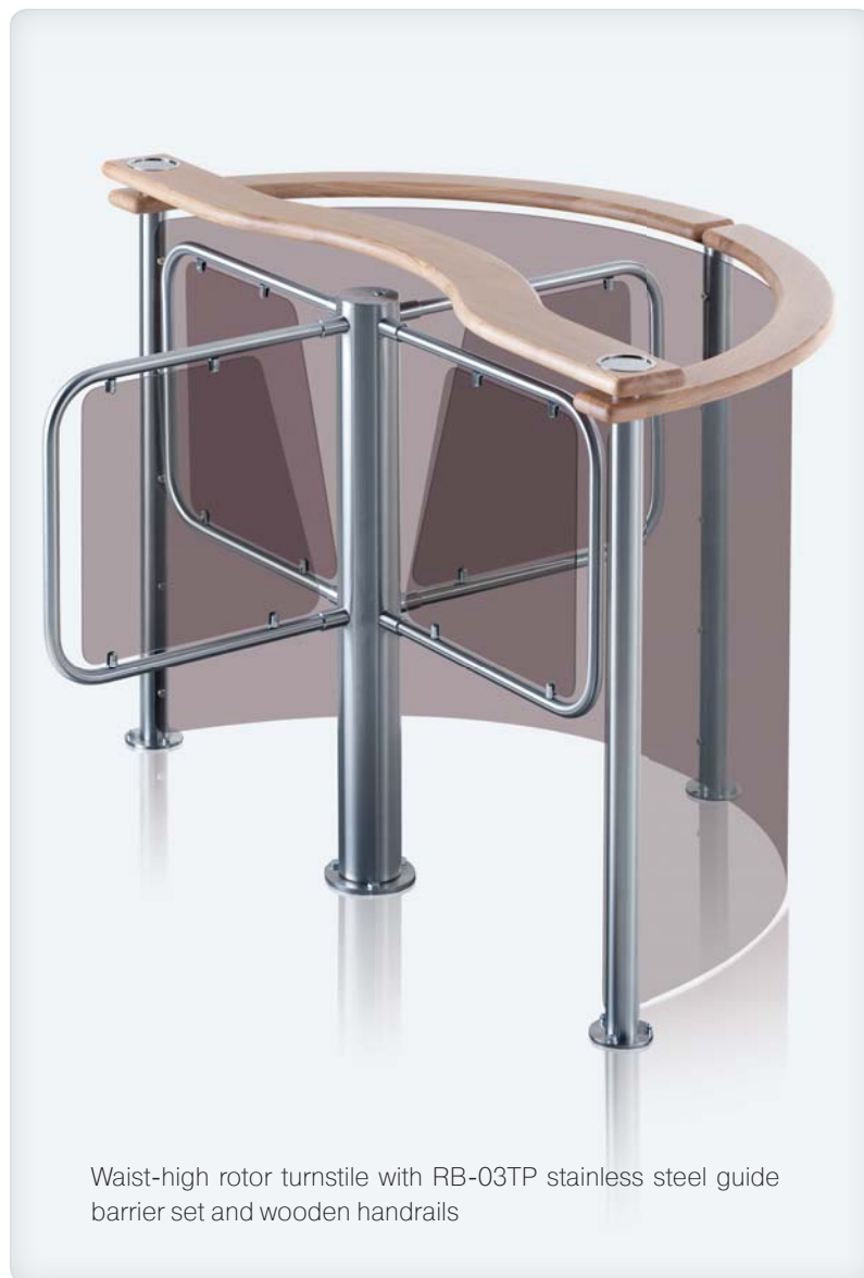
Waist-high rotor turnstile with RB-03TP stainless steel guide barrier set and wooden handrails