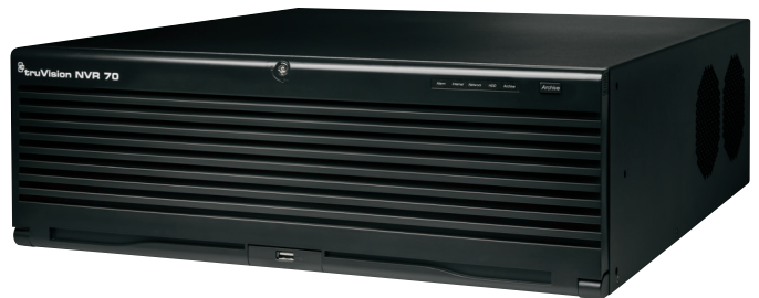
TruVision NVR 70

Select TruVision® Network Video Recorders (NVRs) by Interlogix can also be integrated with the Prism VMS. By downloading a driver pack, users are able to access and unlock recorded tracks via the Prism dashboard. Users can set up events for cameras connected directly to select TruVision NVRs for simple plug-and-play configurations. Ideal for small- to mid-scale applications, these recorders provide full support with the Prism Video Matrix.